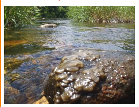
Cymbella Janischii is beginning to bloom.

The West Branch Farmington River has 3 species of "Rock Snot". Two species of "Didymo" are essentially restricted to the section of river from Hogback Dam to the confluence with the Still River in Riverton. Didymo must have very cold water AND little to no phosphorous in the water.